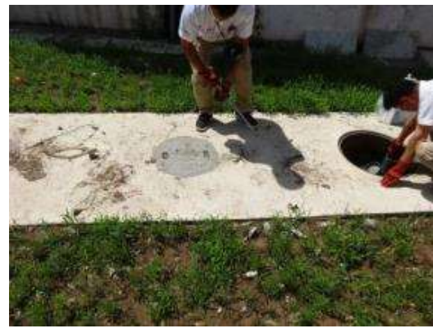
Manholes necessary for O&M