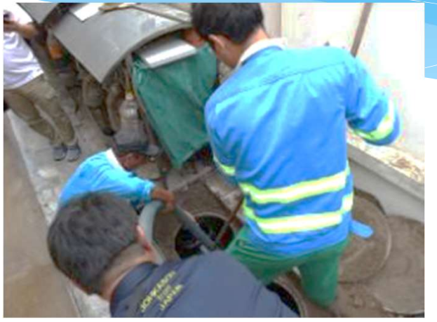
Cleaning by a vacuum car