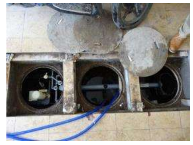
After Cleaning and re-watering