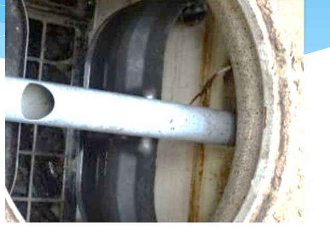
Cracking was found inside