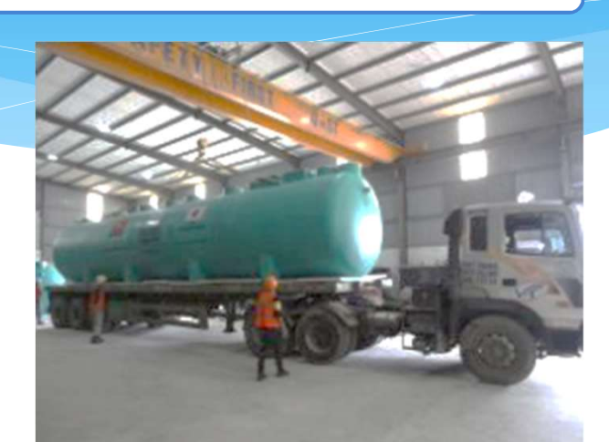
Carrying out from the factory