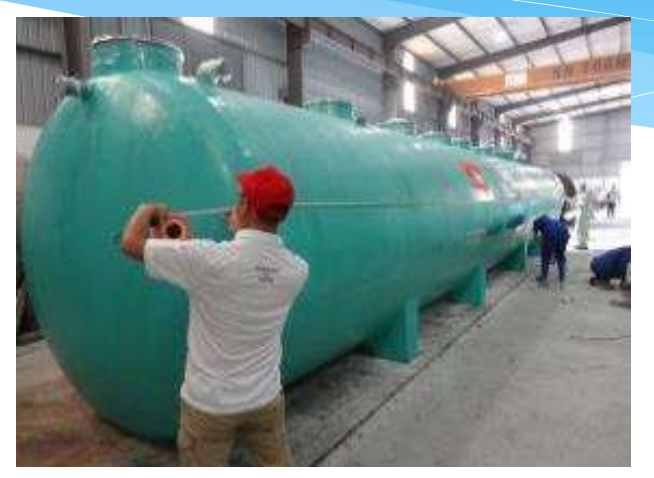
Final inspection in the factory