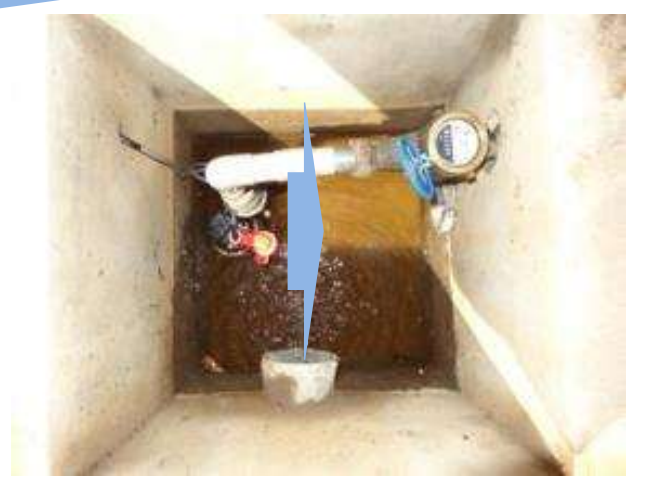
Drainage pit for the final effluent