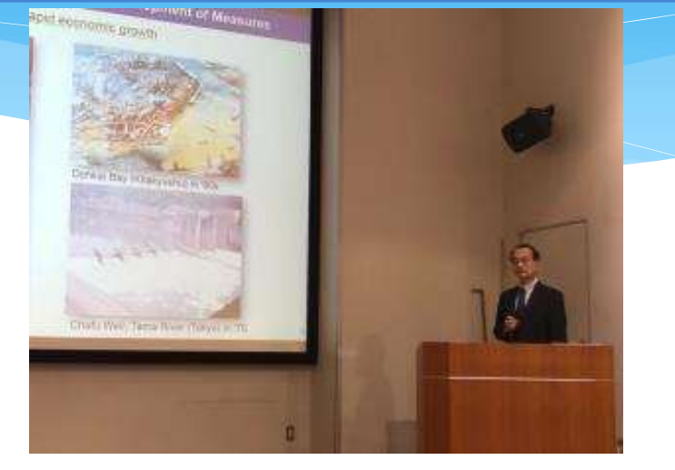
Lecture by Ministry of the Environment